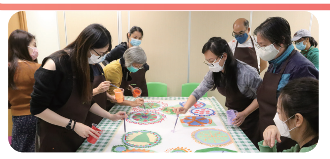
▲ 殘疾人士照顧者藉共同創作互相認識。 Carers of people with disabilities got to know each other by creating artwork together.

To spread positivity and hope amid the battle against COVID-19, "The Pilot Scheme on Professional Outreaching Team for Private Residential Care Homes for Persons with Disabilities" organised a face mask design competition, along with a "Glamourous Rising Star Award" to recognise the best pandemic fighters among the residents of private RCHDs in July and August 2021. A total of 211 face mask designs and 70 video submissions for the "Glamourous Rising Star Award" were received. The online awards ceremony was attended by all 26 of the participating care homes and their staff members, where 29 awards were given out in total. Excitement mounted among the award recipients as the winners were announced.