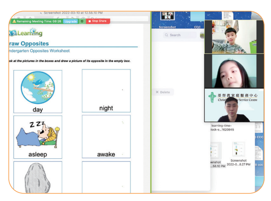
▲ 線上提供創意教材以吸引小朋友的注意。 Creative online materials were used to capture children's attention.

本會的「為輪候資助學前康復服務的兒童提供學習訓練津貼項目」持續為有特別學習需要的兒童及家長提供「視頻訓練」及「訓練學習教材套」服務,讓學童在家也能持續訓練學習,減輕家長面對管教問題之壓力及提供處理方法,過去一年共89個學童接受服務,訓練時數多達445小時。