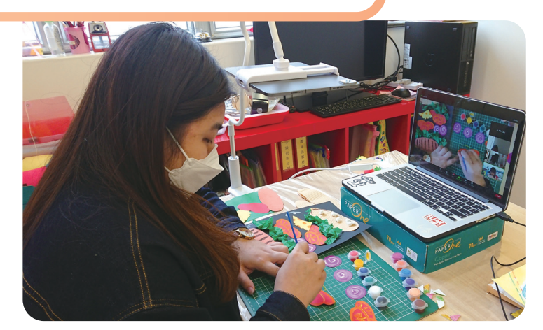
▲ 為學校舉辦網上藝術興趣班。 Our online art programme for schools