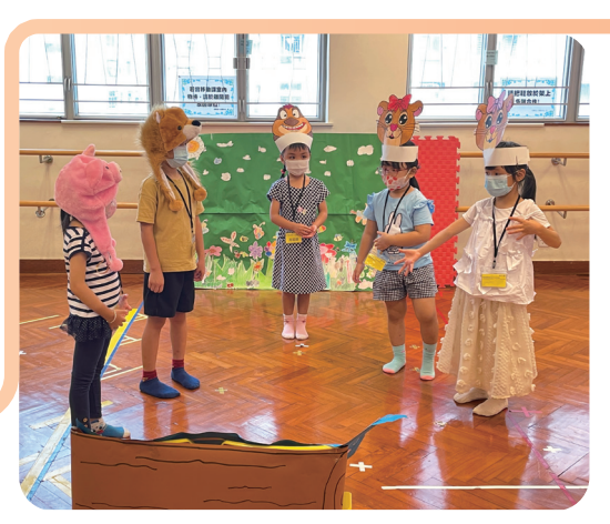
▲ 英語戲劇訓練班 English Kids Theater